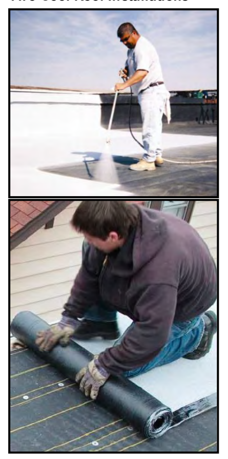
A cool coating is applied to a dark roof (top), and a cool single-ply membrane roof is unrolled (bottom).